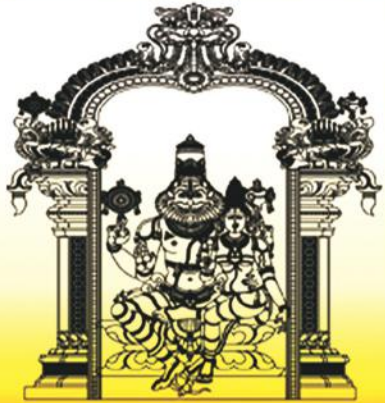
Sri Lakshmi Narasimha