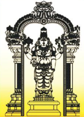
Sri Lakshmi Venkateswara