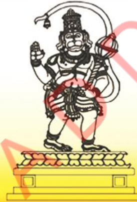
Sri Sankata Mochana Hanuma